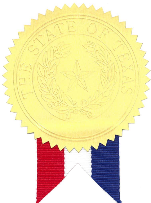
Greg Abbott Governor of Texas

In testimony whereof, I have hereunto signed my name and caused the Seal of the State of Texas to be affixed at the City of Austin this the 20th day of May, 2026.