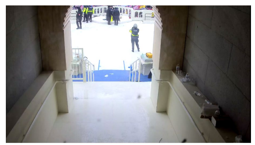
Image 2: The "tunnel" as seen on CCTV footage prior to rioters entering