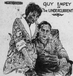
GUY EMPEY in "The UNDERCURRENT"

Saturday, April 17th—Douglas Fairbanks in "Arizona" his best western and more stunts than ever.