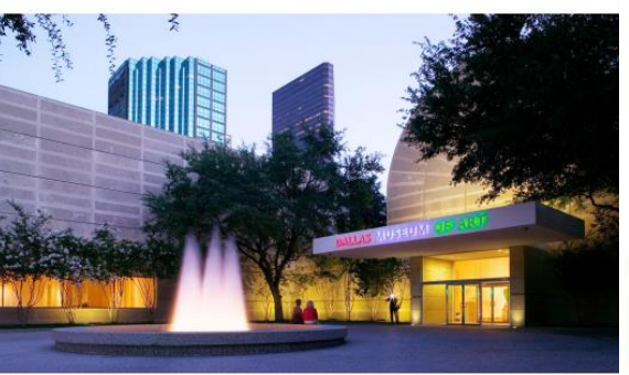
The Dallas Museum of Art