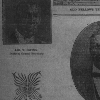
ODD FELLOWS TEMPLE, Houston, Texas